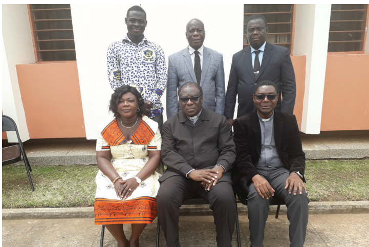
The Moderator (centre) with the outgoing General Assembly Clerk (seated right) and outgoing Lay Reps.