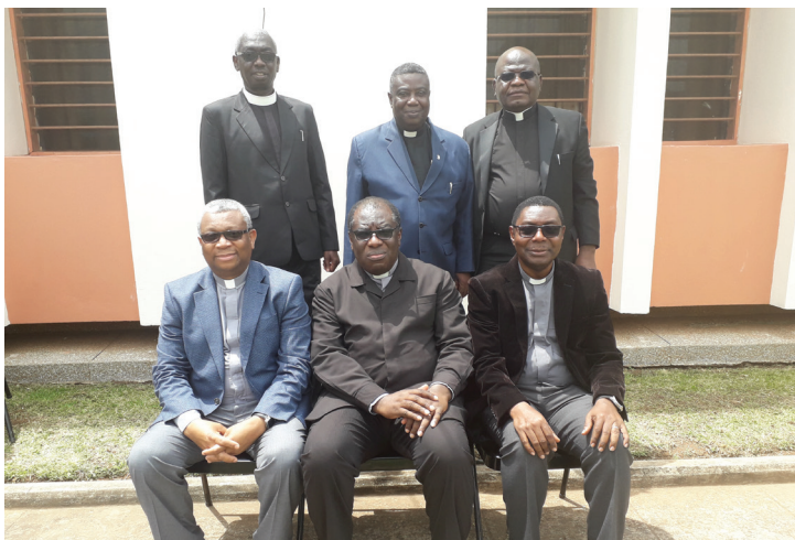
The Moderator (centre) with outgoing Chairpersons